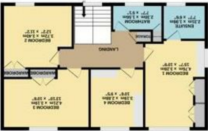
1ST FLOOR 70.9 sq.m. (763 sq.ft.) approx.