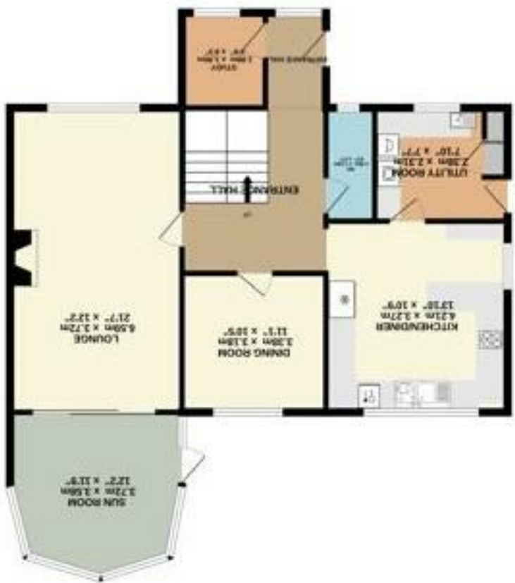
GROUND FLOOR 88.7 sq.m. (953 sq.ft.) approx.

These energy ratings have been made to assist the accuracy of the Energy Company Data (ECOD) of doors, windows, rooms and any other items not specifically mentioned in the Energy Performance Certificate. The data is for illustrative purposes only and should be used as a guide only. It is not intended to be used for any other purpose. The energy ratings have not been tested and no guarantee is given. TOTAL FLOOR AREA: 148.8 sq.m. (1593 sq.ft.) approx.